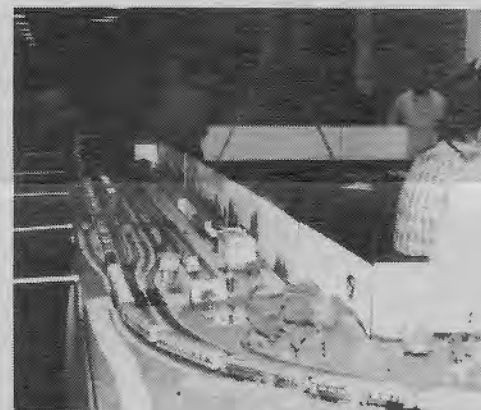
One of the many Layouts on display.

There was much to see. The layout displays were impressive. There were numerous hobby shops and manufacturers and other displays of rail-roadania. The departure time of 3:30 came rather fast. We boarded the bus and left on time. We arrived at 5:10 in the evening.