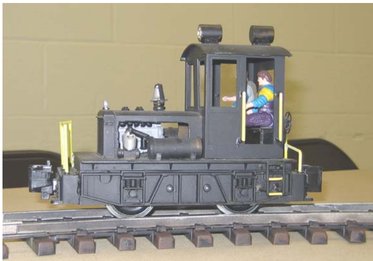
G Shop "Goat"

We'll publish more details as they become available. We'll be looking for people willing to share their layouts, so be sure to read the "Call for Layouts" section of the Semaphore.