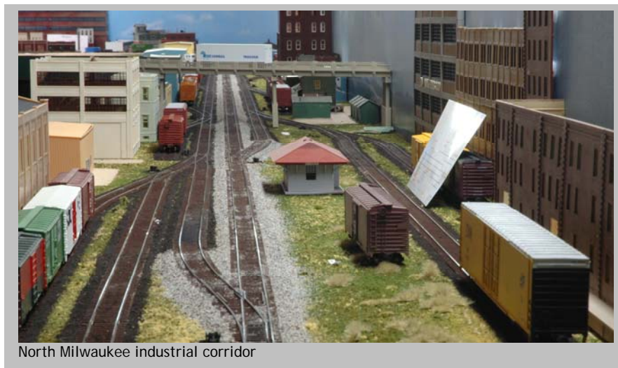
North Milwaukee industrial corridor

If you would like to see this impressive layout, contact me. I will put you in touch with Tom. To learn more about the Milwaukee Road in the 1970's, you can find a wealth of information on the Milwaukee Road Historical Association website: http://www.mrha.com/ More layout pictures are available for viewing on the Fox Valley Division website: http://www.foxvalleydivision.org