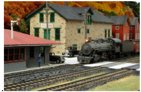
Old #16 waits in front of the company store at the Robertsdale station for train orders and a meet with an oncoming coal drag. Robertsdale is the company town developed near the Rockhill #1 mine