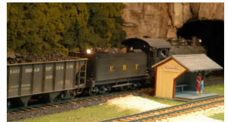
A revenue fare waits patiently on the Kimmel platform wondering if the mixed freight will be on time today. Meanwhile #18 continues the climb into a bore. Coal rules on this railroad.