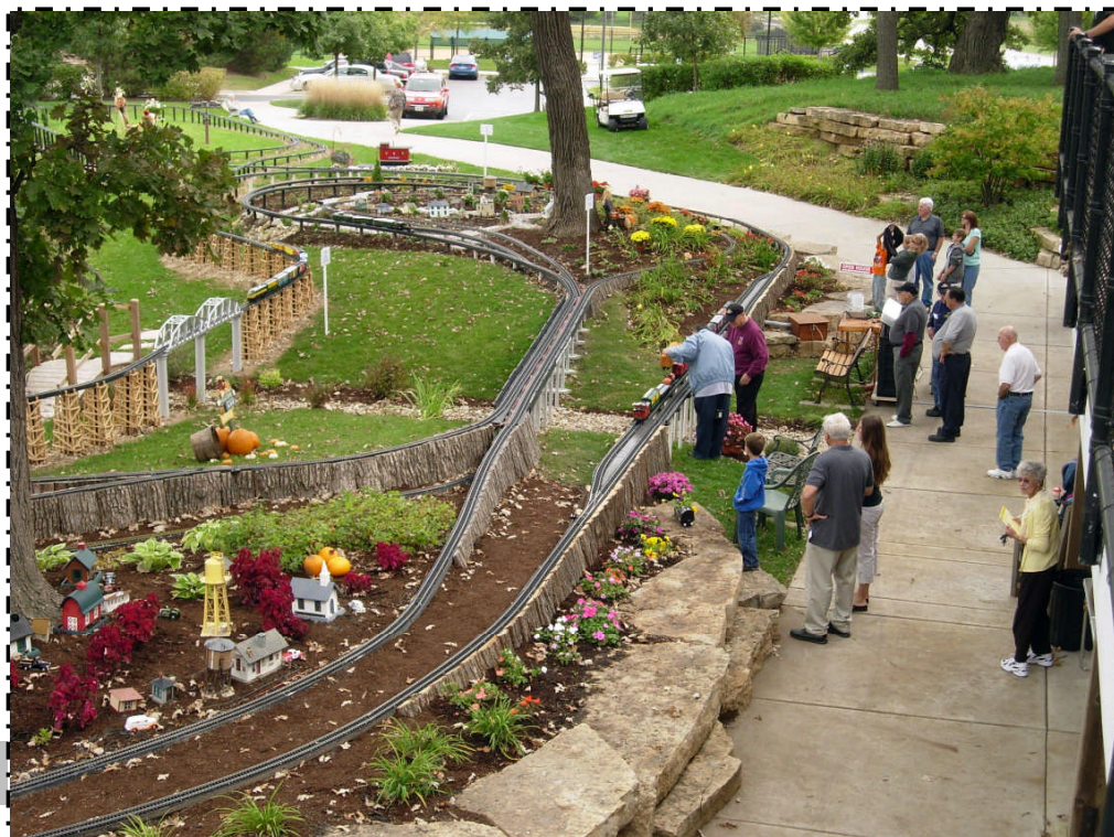
Fun in the Sun (City)

The Woodchucks built trestle fascias to surround the track base pipes where they were excessively high above the