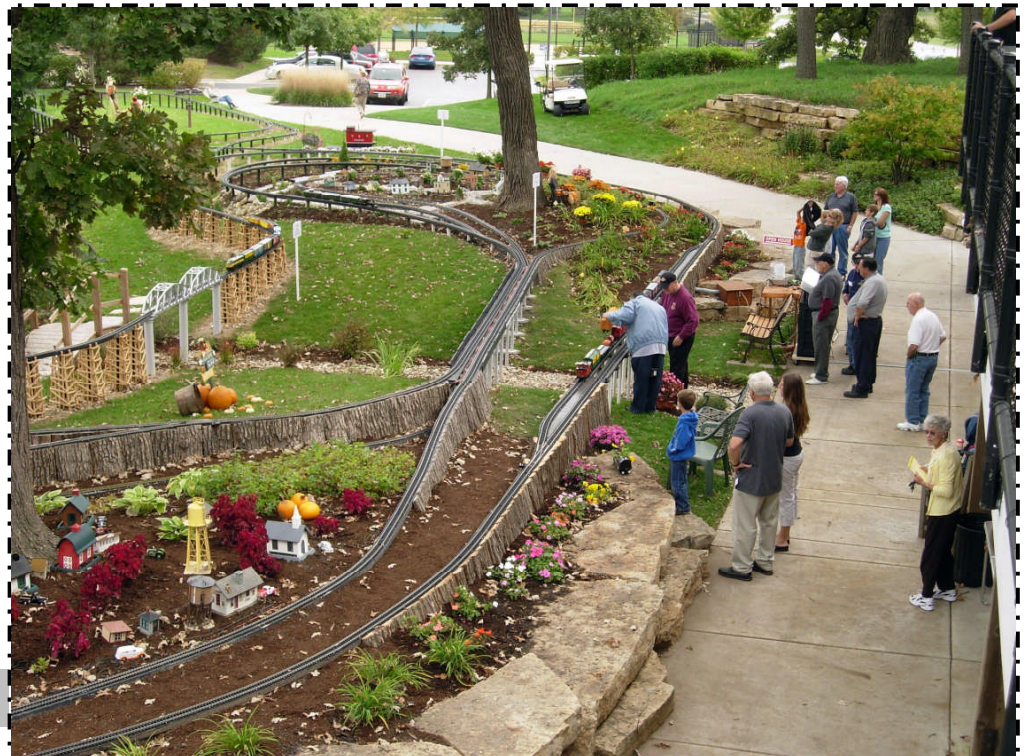
Fun in the Sun (City)

The Woodchucks built trestle fascias to surround the track base pipes where they were excessively high above the