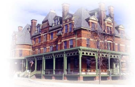
The Hotel Florence in Pullman, Illinois

Mark your calendars now for October 11 th . That's the day we take a bus road trip with the North Shore Division to historic Pullman, Illinois. This will be a great trip and a perfect one to invite your wife to! Learn more on page 2.