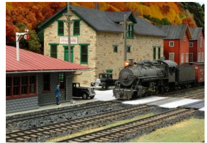
Crement EBT scratch built structures

Fox Valley's own Dave Crement, MMR will be presenting an excellent September clinic on "Scratch Building Structures". Dave will take us through the entire scratch building process he uses to produce the prototype inspired structures that are on his On3 EBT RR layout. See how this master modeler builds beautiful, one of a kind structures in wood and plastic on September 20 th .