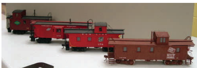
Don Robinson's O scale kit and scratch built mixed road cabooses