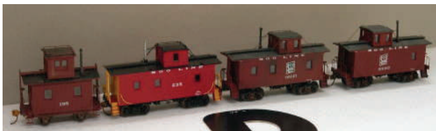
MMR Dave Leider's HO scale caboose train of kit and scratch built models of SOO prototypes..