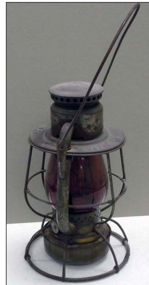
Art Paton's B&M brakeman Lantern (April contest entry)