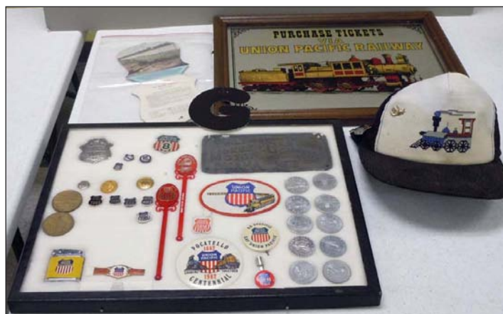
Walter's Radtke's RR history memorabilia (April contest entry)

The Frisco 1630 passed it's hydro tests in early April, as preparations continue for the final FRA inspections (Some weeks in the future) As of yesterday (Saturday 4/9), IRM volunteers were loading the Frisco1630 with coal and water,,,, have to feed the beast to test it.