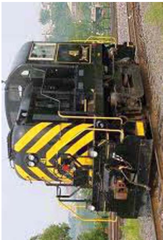
Alco RS1.25 Leftover