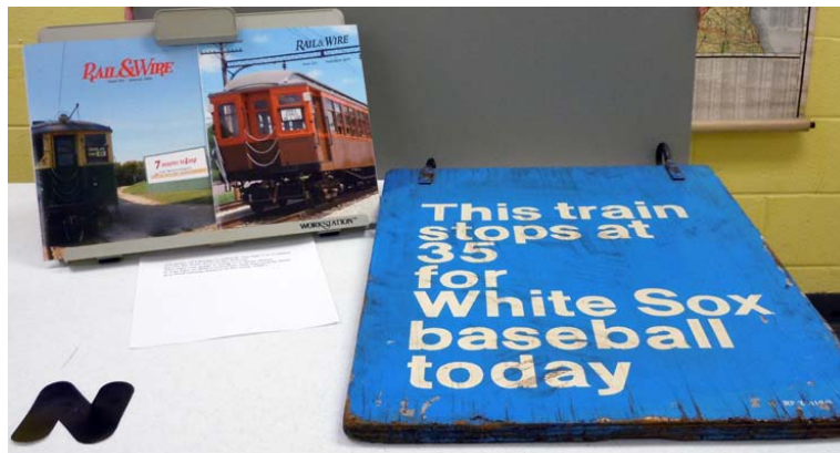
Dick Koch's L-Subway Destination sign (April contest entry)