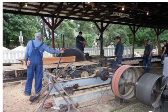
Cutting a large log at Hesston's steam saw mill.