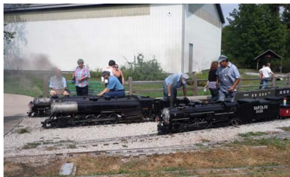
Three live steamers ready to roll.

Many of us didn't quite know what to expect at Hesston. I, for one, hadn't been there in forty one years and things had changed! There was still the