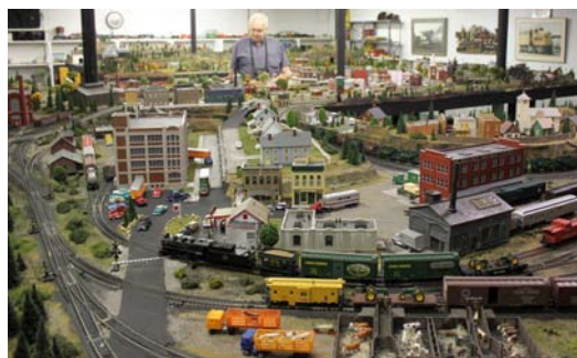
One of the layouts in Rockford.

Hello everyone! I hope you all had a fun and relaxing summer. Did you enjoy any rail fanning or other railroad related events this summer? I had a very exciting summer this year, thanks to the new FVD "Local RR Related Events" web page. I tried to visit as many local railroad events as I could fit in my schedule. I kicked the summer off with a trip to Rockford on June 3rd. The Rock River Valley Division had a Layout Tour Weekend, with over 20 terrific layouts open to