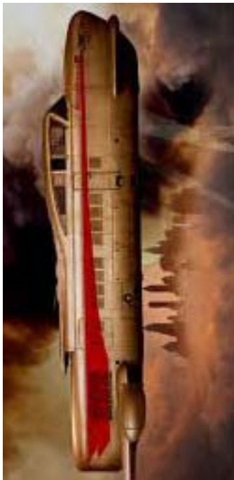
The true Aerotrain.