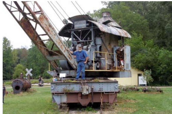
Hesston's standard gauge steam crane and its operator.

A nice "Parade of Power" showcasing and describing the farm equipment at Hesston that day ended our stay there. Those of us who went on the trip want thank the division for organizing the event, and paying for the bus, the Hesston admittance fee, and train tickets. Hesston was certainly a Fox Valley Division trip we'll remember for years to come.