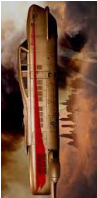
The true Aerotrain.