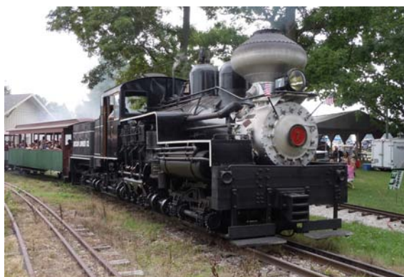
Three foot gauge Shay #7 is Hesston's "crown jewel".

strong, sweet smell of steam as you walked through the main gate. But there were a lot more trains. In addition to the original single three foot narrow gauge line I rode on when I was twenty, the museum now had 1/4 scale and 1/8 scale lines featuring an assortment of old, beautifully restored amusement park steam engines and equally beautiful private owner live steamers, as well as several very nice gas powered "diesels". My friend, John Knoll, said, "I love these little ones! I could ride these all day!" Not me. I'll take Hesston's big, wood fired, three foot Shay #7 any day, and I did—twice! All but one of the lines ventured deep into the museum's 92 acres of heavily wooded property making for nice long rides. One other 1/4 scale line skirted the woods and then circled the museum's large open field parking lot. Double headed live steam 4-8-4's were the featured power on that line that day, and the engineers running those locos knew what they were doing.