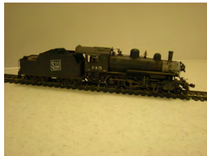
Will Westfall's 2nd Place HO scale Soo 2-6-0.