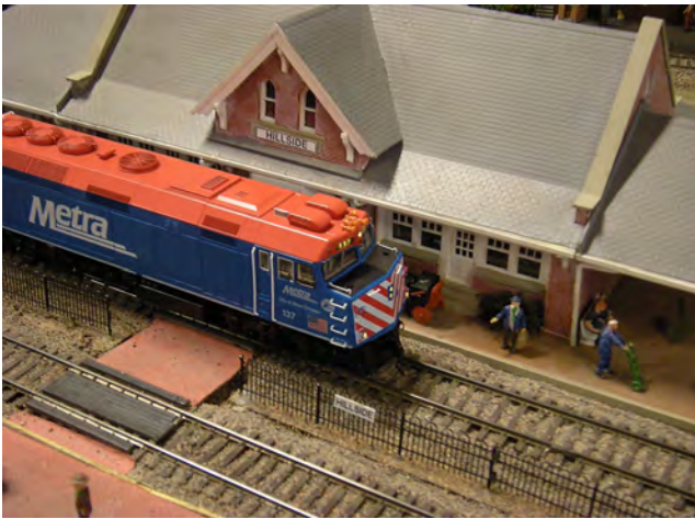
A Metra "Scoot" pulls into the brick station at Hillside