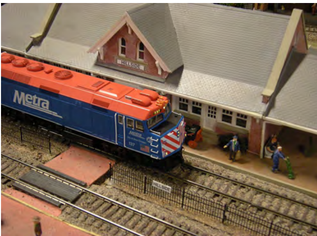
A Metra "Scoot" pulls into the brick station at Hillside