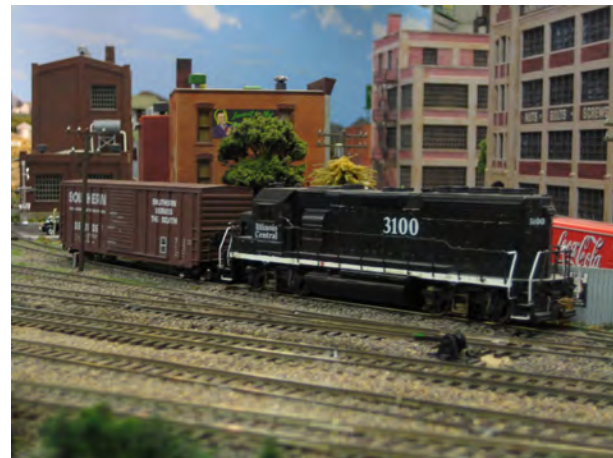
IC 3100 switches one of the many industries at Wallace.

The Hillside Yard locomotive facilities and caboose tracks are usually a beehive of activity on the KV&EC Club's HO model railroad. Almost all of the layout's locomotives and much of its rolling stock are owned by members which makes for a variety of neat equipment being run on operating nights. Annual member dues and a holiday season train set drawing at its large Holiday Display Layout in Sun City's Prairie View Lodge, finance new projects and cover the maintenance expenses on the club's four layouts.