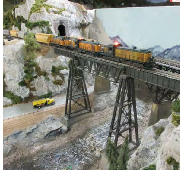
A trio of Chicago Northwestern RS3s cross the high trestle at Gaskill Run on the Garfield-Clarendon MRR Club's large HO layout.

Chicago's Garfield-Clarendon Model Railroad Club was founded in Garfield Park in 1947. Since that time it has built five different model railroads in two locations. The model railroad featured in this Semaphore was started in 1974 in the Chicago Park District's Clarendon Park Fieldhouse. With a layout size of 49 x 27 feet and 1,500 feet of hand laid HO track, it is among the nation's largest club model railroads. The layout's theme is a generic Class I Appalachian coal road located somewhere around Pittsburgh. Despite the Appalachian theme, you will see a lot of different roads' motive power and rolling stock operating on the layout at any one time due to the varied