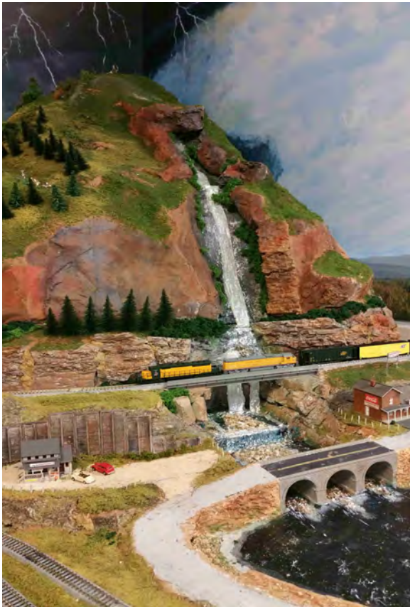
CNW and UP six axle power cross the bridge over the large waterfall cascading down Thunder Mountain. This scene is animated featuring lightning from behind the mountain, loud thunder and a steam train whistle all at the push of a button.