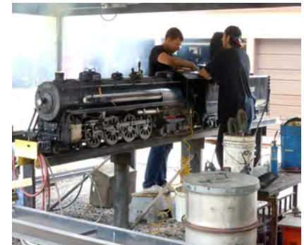
ILS crew members prep a big 4-8-4 steam engine for running. It took a good hour to fire this locomotive!