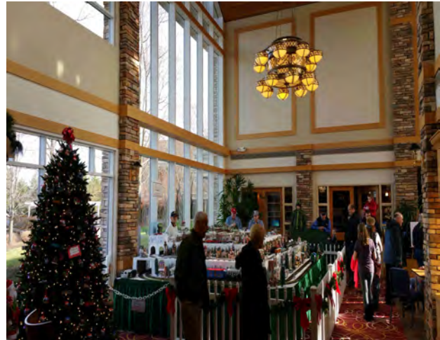
The KV&EC Holiday Display Layout is set up in Sun City's Huntley's Prairie View Lodge's Social Lounge just off the main entrance. It's open 5 weeks each year.

It takes about 2 1/2 days to unpack, put up and prep the layout for viewing. It only takes a half day to disassemble and put the layout back into storage. The many sections of the layout are stored in a closet, and under the bench work of the layouts at the KV&EC's permanent layout room several blocks away from the Prairie Lodge. A dozen or so club members are con't on p. 3