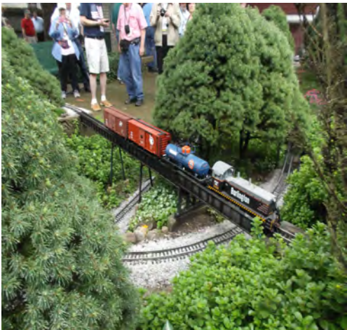
Here's Jeff Carter's Garden Railroad in #1 scale (left and right). The road features 300 feet of mainline, DCC and a switch tower from which turn-outs and trains can be controlled if so desired. "Ship It" software is used in operations.