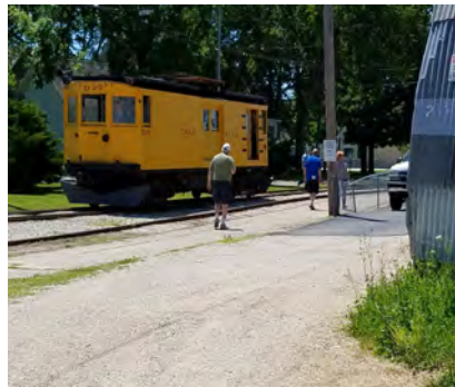
FVD members walk toward MER&L line car D23 for a closer look (left). Pete talked with a Park Ranger there to commemorate East Troy's 110th anniversary.