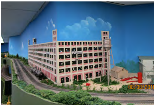
“The left photo show the way the Priest’s disguised a 90 degree corner on the layout— with a huge industrial structure! On the right we see a TOFC train heading up hill on a narrow 18 inch wide upper deck of this section of the layout. The bottom deck is the same width. The aisle is about three and a half feet wide.”