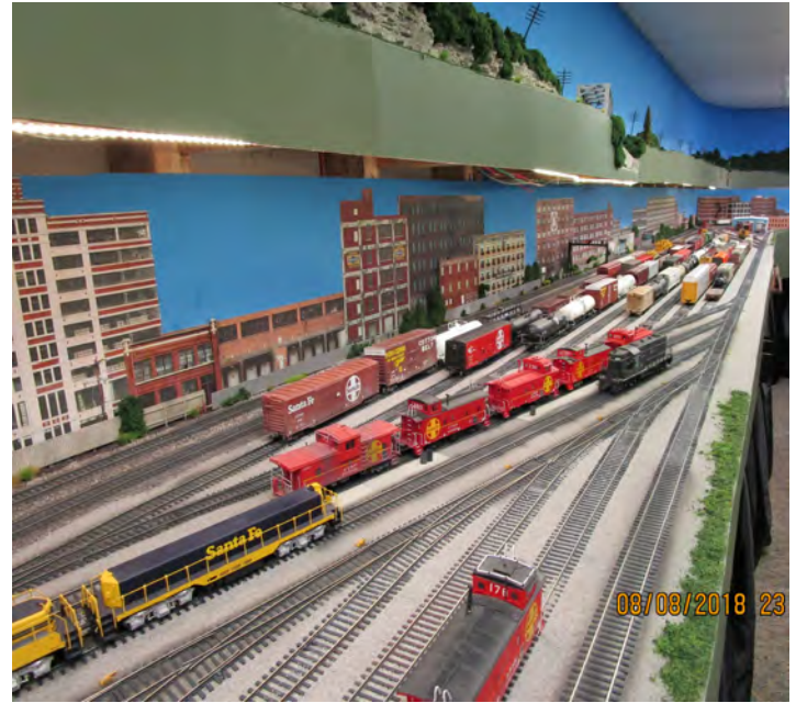
“Above shows the double deck construction of the Priest layout near the end of a peninsula. To the right is the large, long Chesterfield Yard. Chesterfield is the first town out of west staging. Note the upper deck is set back from the lower deck about 18 inches.”