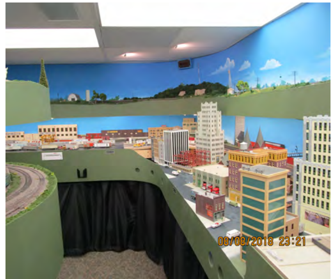
“The above photo is going around an industrial area, and the above right photo shows a layout aisle going left that just keeps going, and going and going! There are an amazing number of structures on the layout, and many really large structures.”