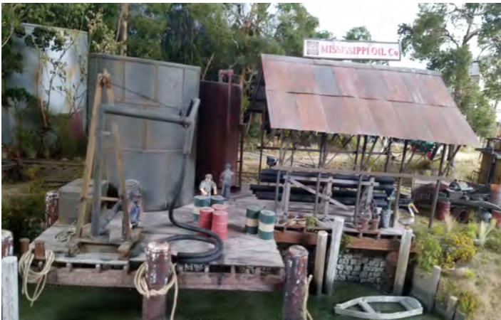
Two of Geoff Nott's excellent structures on the MRRR are shown above, the Bayou Fish Co. and the Mississippi Oil Co. Both are fully detailed inside and out.