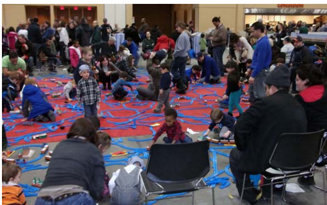
Junior Engineers "Whose got the track plan?"