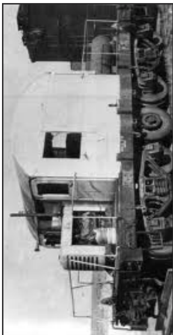
Loco on freight car trucks. Power transmitted to truck tires in contact with rail.