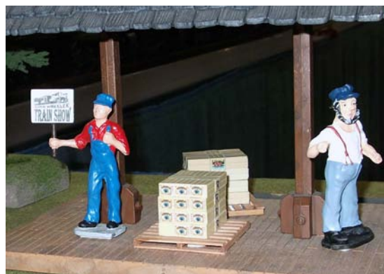
One of Bert Lattan's G Scale friends advertising our upcoming show.