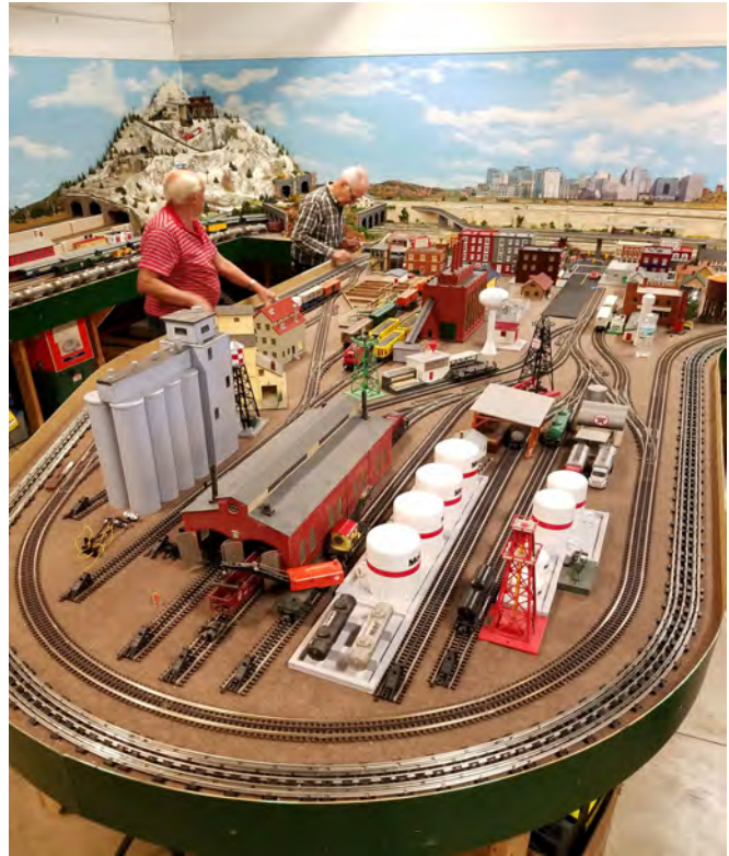
The KV&EC club's new hi rail O gauge layout addition.

But, "fun" is the operative word with this O scale group. They built the new additional to have more fun running and displaying their trains for themselves and the public at open houses. I'd say they've succeeded admirably, but then I'm a loyal KV&EC club member and perhaps a little biased!