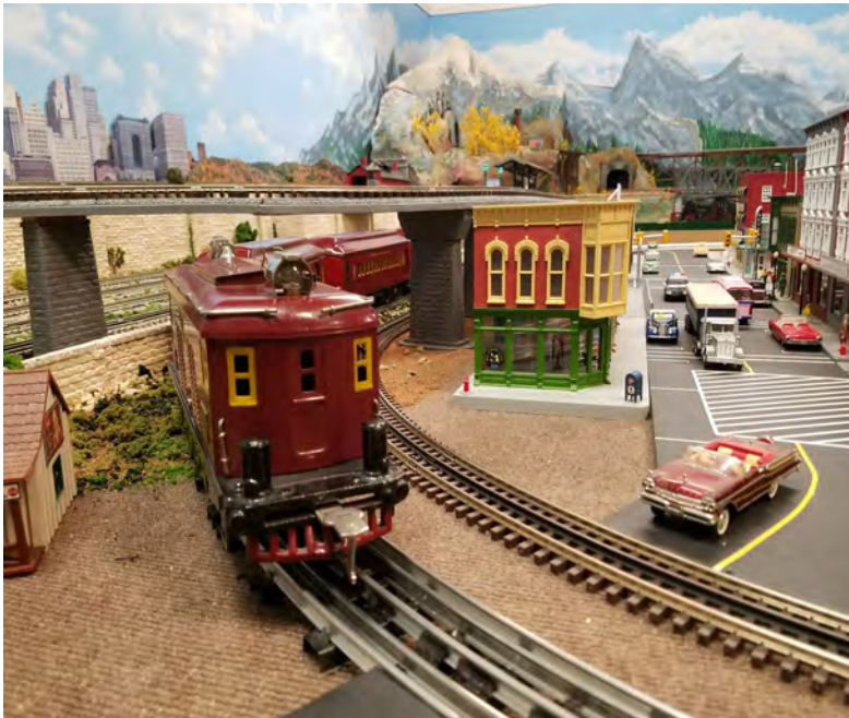
An American Flyer standard O gauge box cab diesel leads its three passenger car consist through a 72 inch radius curve on the KV&EC's club's new O gauge layout addition. Urban scenery is 75% complete.