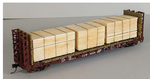
1st Place - Lumber Load

https://form.jotform.com/201995250508962