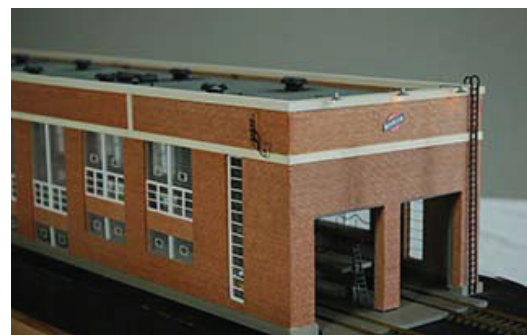
Here's a February through example.